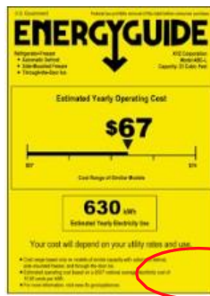
Energy Guide label WITHOUT Energy star logo.